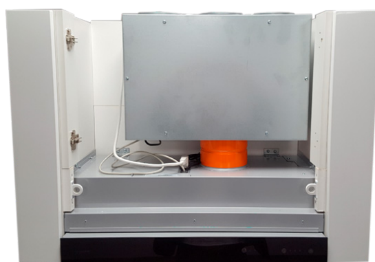
Twist installed with Salsa cooker hood

It is also possible to control the fan unit with the EC regulator (IEC), which is available as an accessory, equipped with a 0-10 V output.